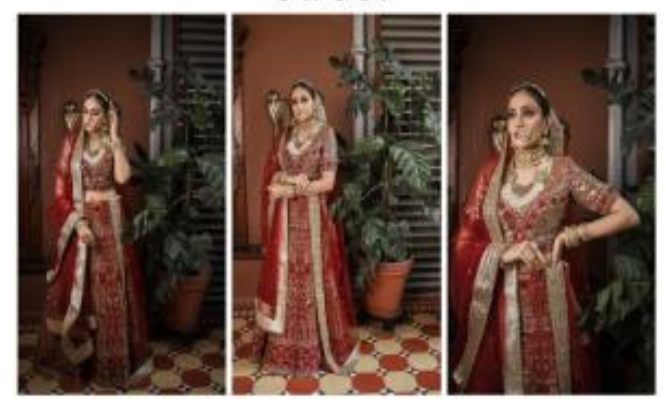
ZARDOZI LEHENGA CHOLI

Zardoshi's work looks ten times more royal and glorious when it becomes a part of Lehenga Choli. The trend of Zardoshi work sprouts as re-fashion over South Asia and West Asia continental countries. While going to the back of this beautiful embroidery, Zardoshi's work is the type of Persian embroidery . Persia was a developed country during the medieval time of India and currently, the area of Persia is known as 'Iran'. Zardoshi's work can be crafted on silk fabric, and mostly georgette fabric is used while using Zardoshi's work.