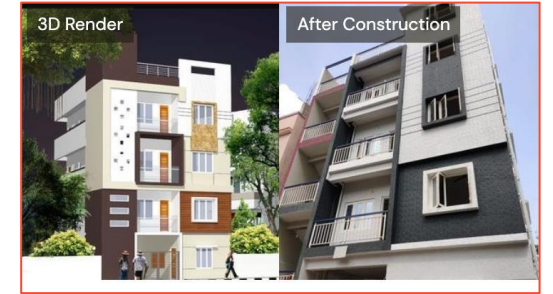
ORDER ID - 03566