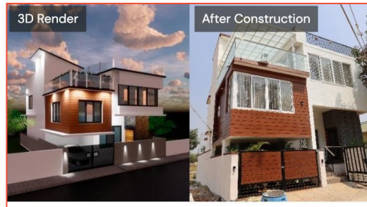
ORDER ID - 056678