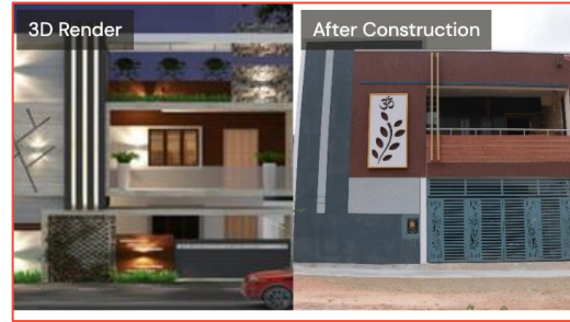
ORDER ID - 03444