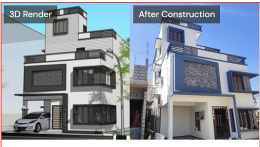
ORDER ID - 05455