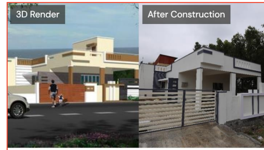
ORDER ID - 09223