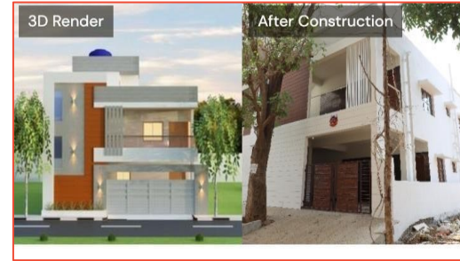
ORDER ID - 03445