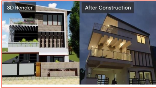
ORDER ID - 03432