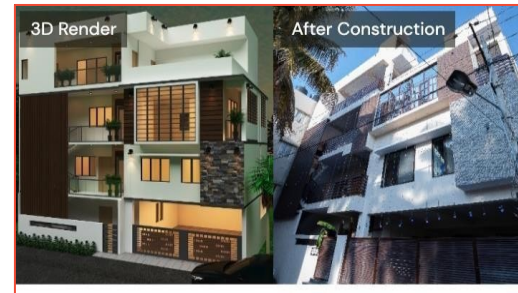
ORDER ID - 00988