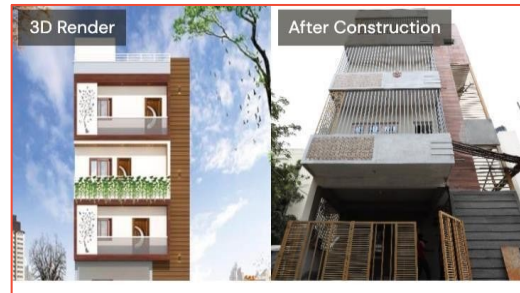
ORDER ID - 00912