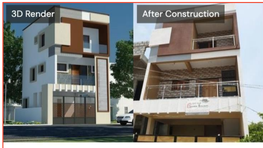
ORDER ID - 09123