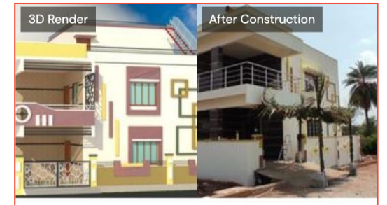
ORDER ID - 07645